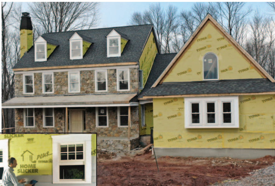
Several factors can determine the choice of wall assembly system for keeping water out of a residential project, including the project's location and the cladding material used.